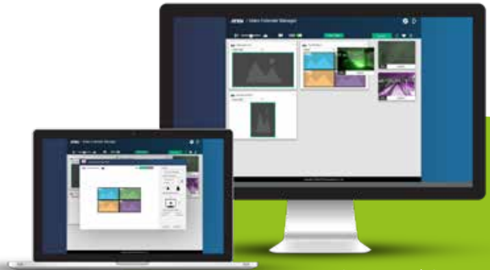
VE8900 / VE8950 webGUI